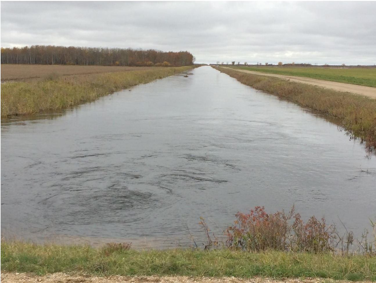
Lat1 SD95 at Roseau County Road 103 – looking west The 'New' 95 will be located on the south (left in this photo) side of the existing ditch