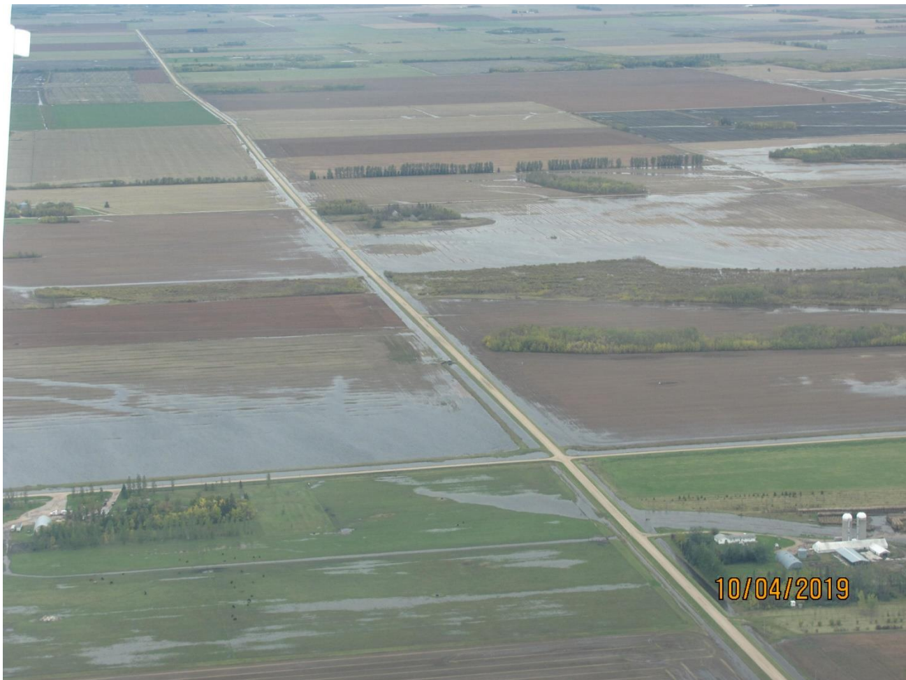
Looking south at Roseau Co Rd 103. Section 4 Barto Twp on left; Section 5 Barto Twp on right