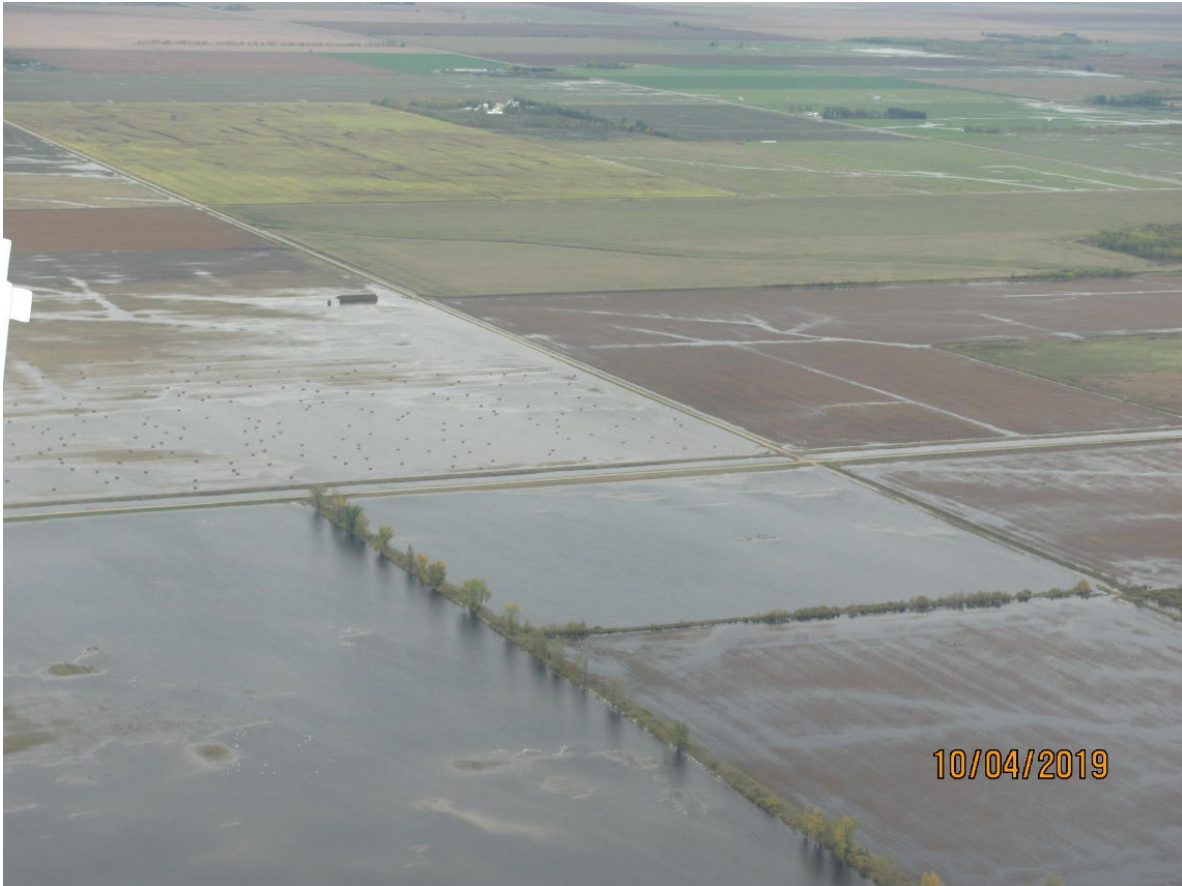
Looking South at Lat 1 SD 95: Sect 6 Barto Twp on left & Sect 1 Polonia Twp on right