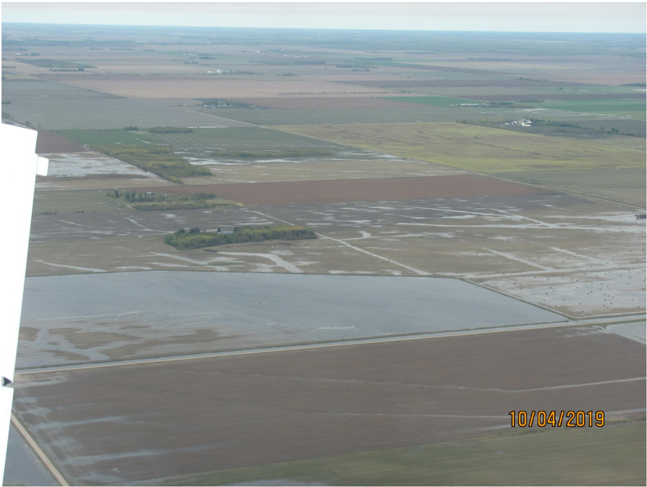
Looking south – Section 6 Barto Twp Roseau Co. Lat1 SD95 in foreground