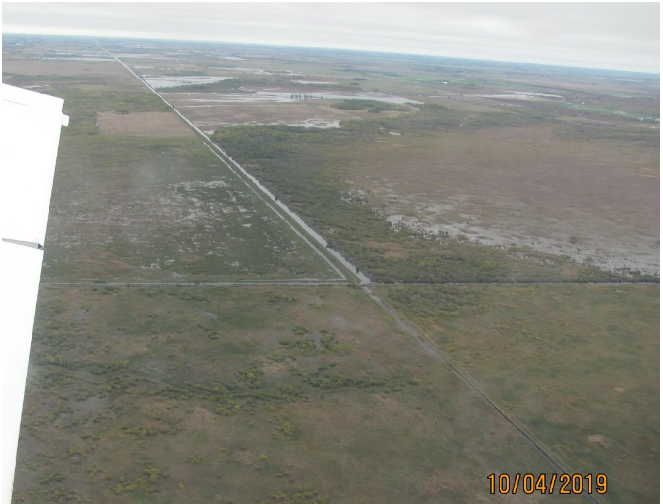
Lat1 SD95 - Looking East Kittson Co. foreground & Roseau Co. Background - Peatland Twp section 36 in lower left