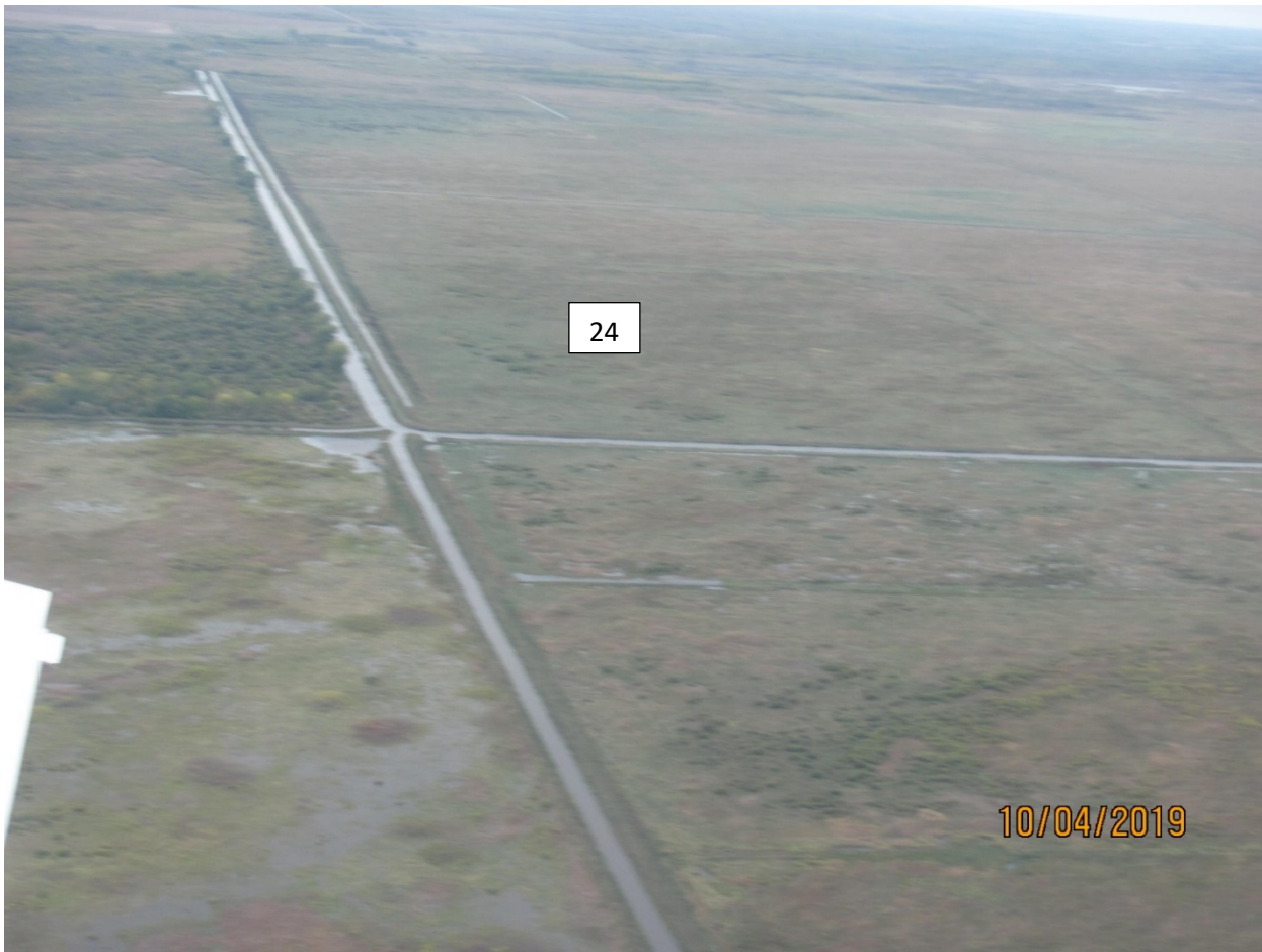
Roseau County in foreground; Lat1 Br4 SD95 - Kittson County in background; Lat1 SD95